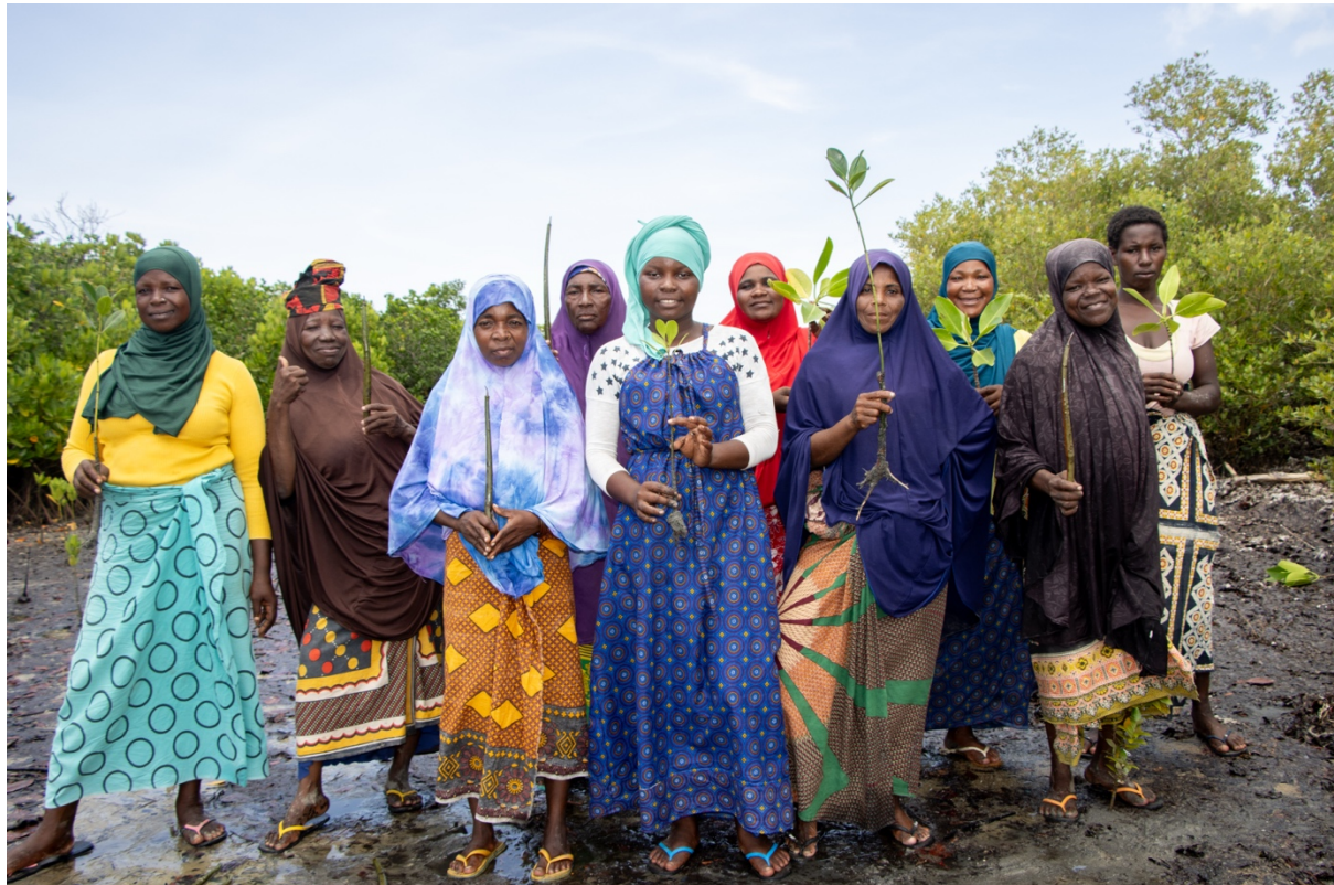
A community-run mangrove nursery in Bagamoyo, Tanzania, supports coastal restoration efforts led by the Aga Khan Foundation as part of its Indian Ocean Coastal Regeneration Initiative.

The AKF's development approach recognises that poverty is multidimensional, shaped by interconnected social, economic, environmental, and institutional factors. Addressing these challenges requires integrated, long-term responses that strengthen systems and address root causes of vulnerability.