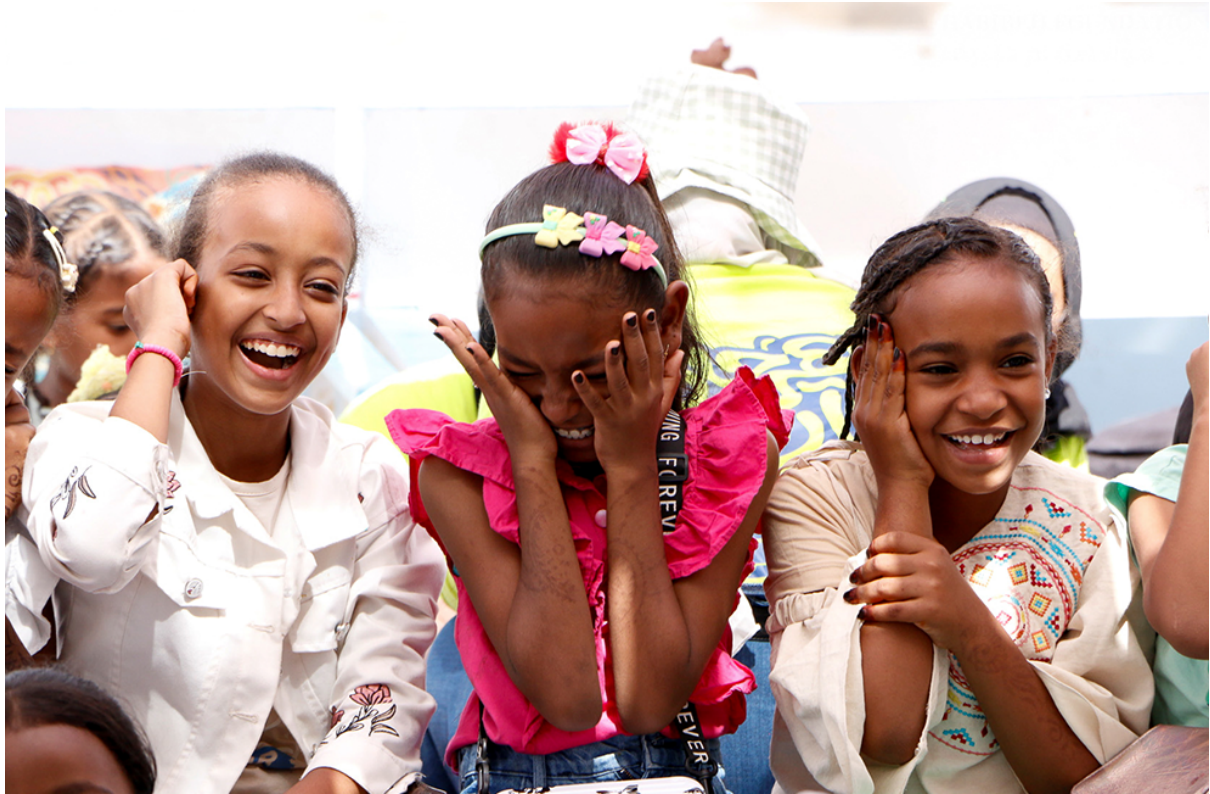
Three young refugee girls share a moment of laughter at Egypt's Arty Narty Festival, bringing Sudanese and Egyptian children together through creativity, supported by the Aga Khan Foundation.